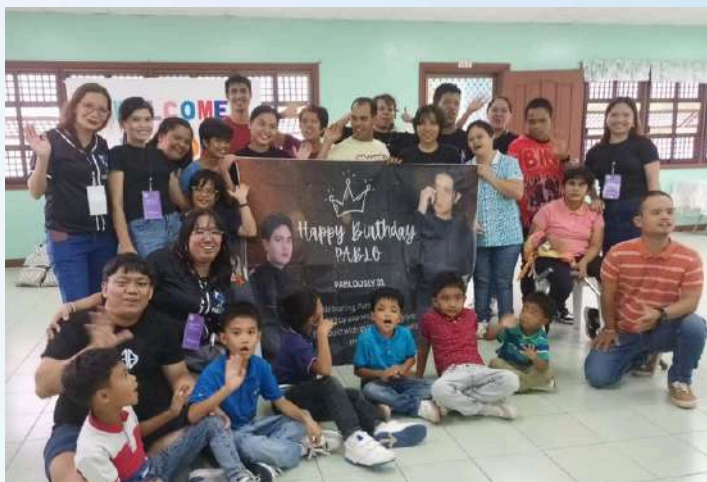
Pablo Alliance of SB19